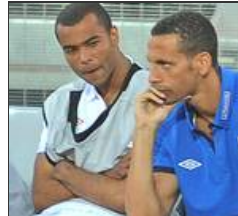
Grace Dent: 3,066,607 followers, one false move...