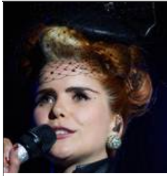
Paloma Faith does cellulite dance