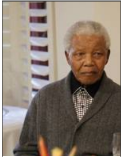
Mandela at 94