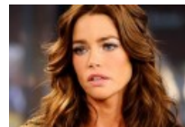
Denise Richards According to Denise, she's not sure that her estranged ex is completely sober....