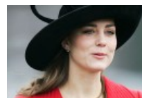
Kate Middleton Kate Middleton is officially a princess. She walked the aisle in an Alexander...